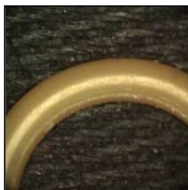
Kalrez® 9100 Top Nozzle Seal