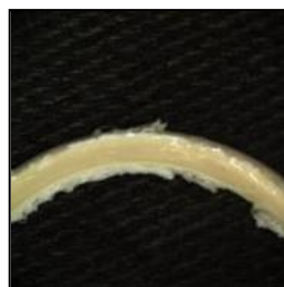
Incumbent FFKM Poppet Seal