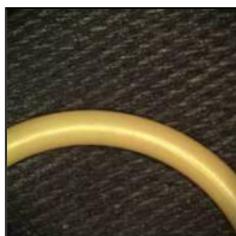
Kalrez® 9100 Poppet Seal

Figure 2. DuPont™ Kalrez® 9100 and incumbent seals after processing 5000 wafers. It was the research center's opinion that the Kalrez® 9100 seals could have continued to function beyond the scheduled PM cycle of 5,000 wafers.