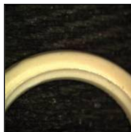
Incumbent FFKM Top Nozzle Seal